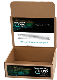
Box Front & Back

Box Front & Back 11"x1.75" with .125" bleed