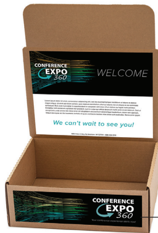
Box Front & Back

Box Front & Back 11"x3" with .125" bleed